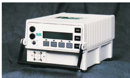
Weather Cast Receiver CLIN # 4920 J Series