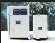
Cable and Utility Boxes CLIN # 133 A - C Series