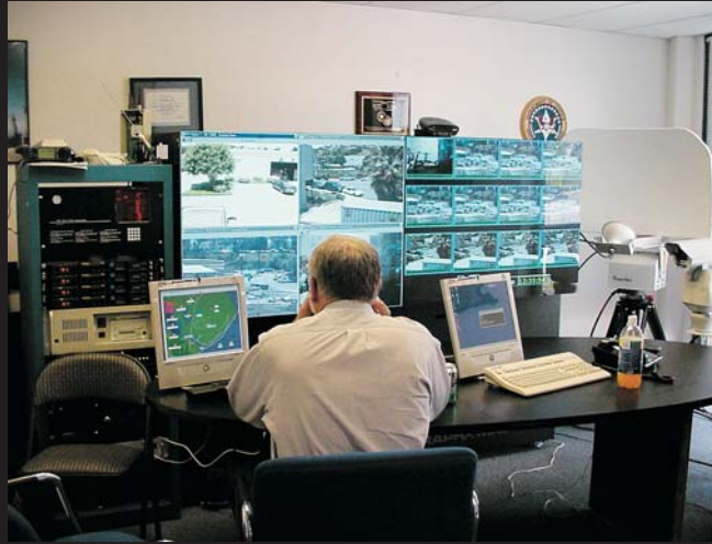
NS 9100 System and Command Center Displays CLIN # 143 B Series