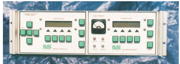
Mobile Microwave Receive Site Rack CLIN # 143 A Series