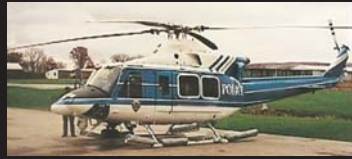
Helicopter System CLIN # 134 Series