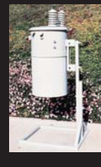
Transformer CLIN # 133 D and O Series