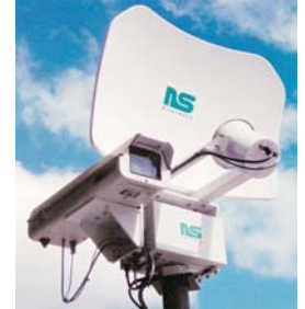
Dish with Camera & Pedestal CLIN # 135 K Series

ATTENTION FEDERAL AGENCIES! All Items Under Quick Procurement Contracts