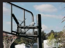
Basketball Hoop CLIN # 133 F Series