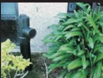
Sewer Vent Pipe CLIN # 133 F Series