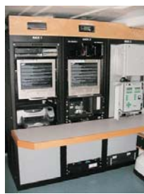
Mobile Receive Site CLIN # 142 A Series