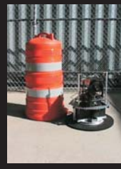
Traffic Barrier CLIN # 133 P Series