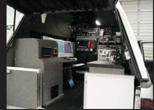
Camper Top Surveillance System CLIN # Pending