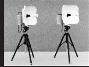
Microwave Link Systems CLIN # 125 A - C Series