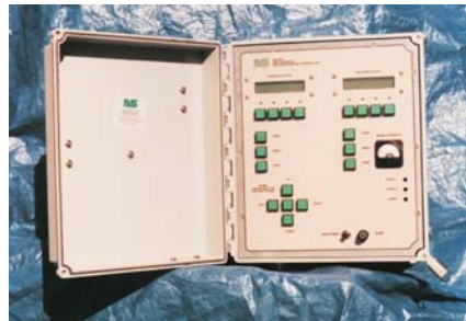
Mobile Microwave Receive Site Controller CLIN # 135 A and B Series