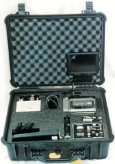
Turnkey NS-2000 Kit CLIN # 4920 O and P Series