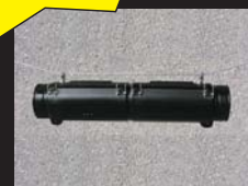
Telephone Splice Boots CLIN # 133 Q and R Series