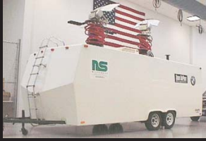
Command and Control Trailer CLIN # 142 A Series