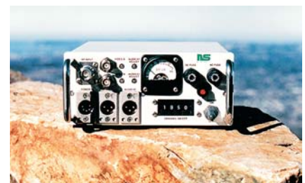
Wide Band Receiver CLIN # 4920 F Series