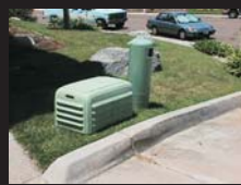
Cable TV CLIN # 133 U and V Series