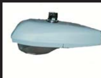
Street Lamp CLIN # 133 W Series