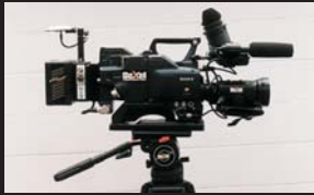
Camera and Transmitter CLIN # 137 D Series