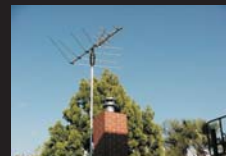
TV Antenna and Chimney CLIN # 133 F Series