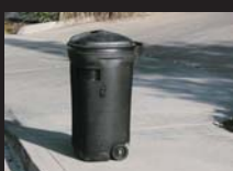
Trashcan CLIN # 133 F Series