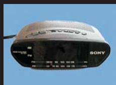
Clock Radio CLIN # 133 E Series