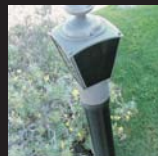
Outdoor Lamp CLIN # 133 F Series