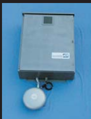
Alarm Box CLIN # 133 N Series