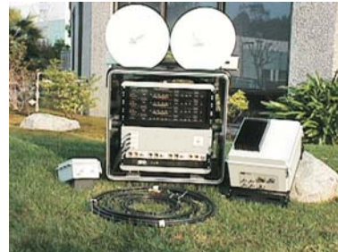
4-Plexer System CLIN # 136 A Series