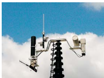
Mobile Microwave Camera Tower CLIN # Pending