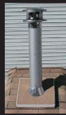
Large Roof Vent CLIN # 133 S Series